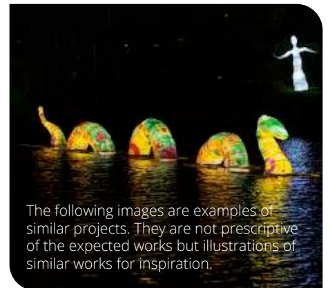
The following images are examples of similar projects. They are not prescriptive of the expected works but illustrations of similar works for inspiration.